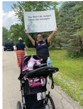
Top : Smudge Walk, Site One