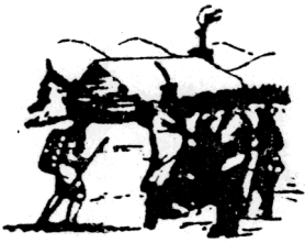
Oneidas bringing several hundred bags of corn to Washington's starving army at Valley Forge after the colonists had consistently refused to aid them