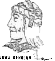
Because of the help of this Oneida Chief in cementing a friendship between the six nations and the Colony of Pennsylvania, a new nation, the United States was made possible.