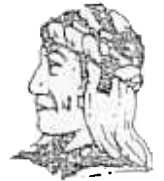
USWA DENOLUN YATENE