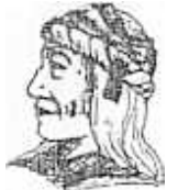
UGWA DENOLUK YATEHE

Because of the help of this Oneida Chief in cementing a friendship between the six nations and the Colony of Pennsylvania, a new nation, the United States was made possible.