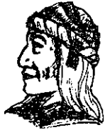
UGWA DEHOLUH YATERE

Because of the help of this Oneida Chief in cementing a friendship between the six nations and the Colony of Pennsylvania, a new nation, the United States was made possible.