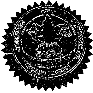
Seal of the Sovereign Oneida Nation

signed this 3rd day of September , 19 97 by