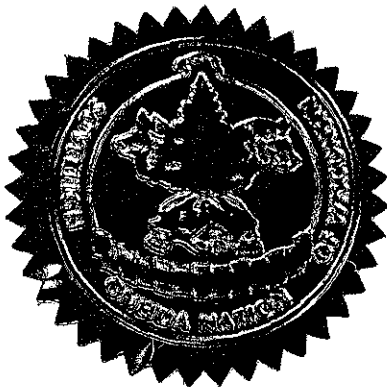
Seal of the Sovereign Oneida Nation

Signed this 3rd day of September , 19 97 by