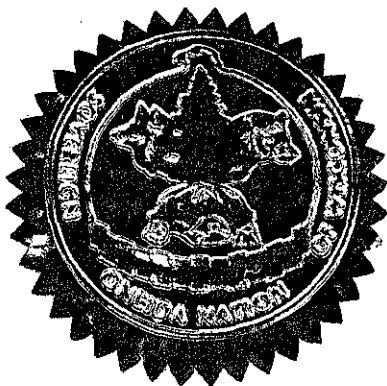
Seal of the Sovereign Oneida Nation

signed this 3rd day of September , 19 97 by