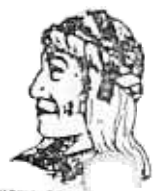
UDWA DEMONSTRATED Because of the help of this Oneida Chief in cementing a friendship between the nations and the Colonies of Pennsylvania, a nation, the United States was made possible.