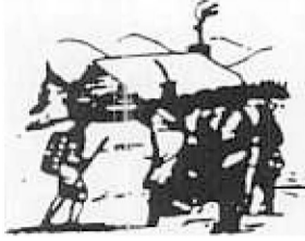
Oneidas bringing several hundred bags of corn to Washington's starving army at Valley Forge after the colonists had consistently refused to aid them.