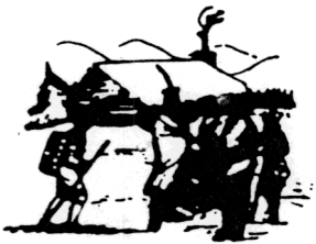
Oneidas bringing several hundred bags of corn to Washington's starving army in 1777. After the colonists had consistently refused to aid them