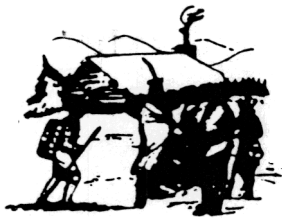
Oneidas bringing several hundred bags of corn to Washington's starving army at Valley Forge, after the British refused to aid them