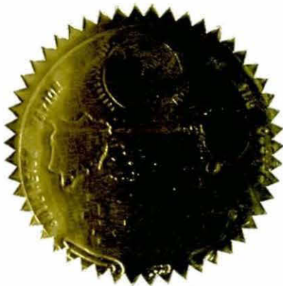
Seal of the Sovereign Oneida Nation