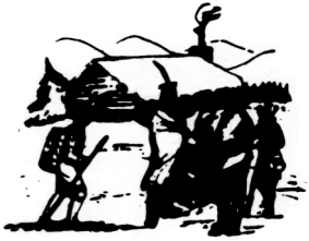
Oneidas bringing several hundred bags of corn to Washington's starving army at Valley Forge. After the colonists had consistently refused to aid them.