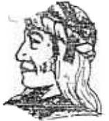
UGWA DEHOLUH YATEHE

Because of the help of this Oneida Chief in cementing a friendship between the six nations and the Colony of Pennsylvania, a new nation, the United States was made possible.