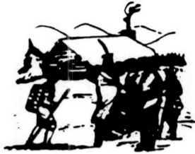
Oneidas bringing several hundred bags of corn to Washington's starving army at Valley Forge, after the colonists had consistently