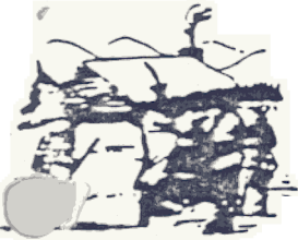
Oneidas bringing several hundred bags of corn to Washington's starving army at Valley Forge after the colonists had consistently