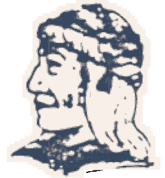
UGWA DEMOLUM YATEHE Because of the help of this Oneida Chief in cementing a friendship between the six nations and the Colonies of Pennsylvania, a new nation for the United States was made possible.