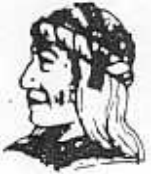
UGWA DEMOLUM YATEHI Because of the help of the Oneida Chief in cementing a friendship between the six nations and the Colon of Pennsylvania, a new nation, the United States, was made possible