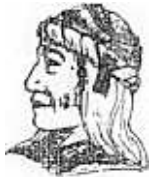
UGWA DENOLUH YATEHE