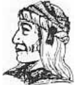
UGWA DEHOLUH YATENE