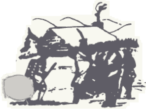
Oneidas bringing several hundred bags of corn to Washington's starving army at Valley Forge, after the colonists had consistently