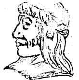
UGWA DEHOLUH YATEHE Because of the help of this Oneida Chief in cementing a friendship between the six nations and the Colony of Pennsylvania, a new nation, the United States was made possible.