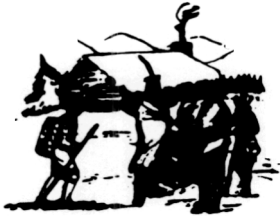
Oneidas bringing several hundred bags of corn to Washington's starving army at Valley Forge, after the celebration had concluded.