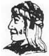
UGWA DEMOLUM YATEHE Because of the help of this Oneida Chief in cementing a friendship between the

tion, the United States, was made possible