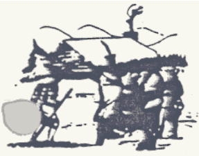
Oneidas bringing several hundred bags of corn to Washington's starving army at Valley Forge, after the colonists had consistently