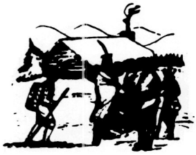
Oneidas bringing several hundred bags of corn to Washington's starving army at Valley Forge, after the colonists had consistently refused to aid them.