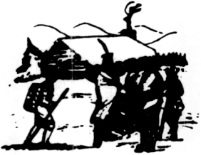
Oneidas bringing several hundred bags of corn to Washington's starving army at Valley Forge, after the colonists had consistently