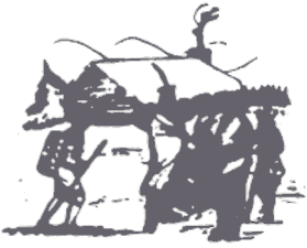
Oneidas bringing several hundred bags of corn to Washington's starving army at Valley Forge. after the colonists had consistently refused to aid them