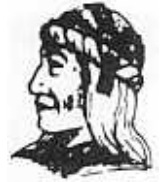
UGWA DEMOLUM YATEHE Because of the help of this Oneida Chief in cementing a friendship between the six nations and the Colony of Pennsylvania, a new nation, the United States, was made possible