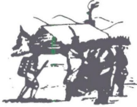
Oneidas bringing several hundred bags of corn to Washington's starving army at Valley Forge, after the colonists had consistently