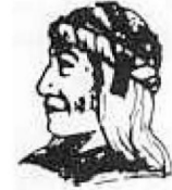
UGWA DEMOLUM YATEHE Because of the help of this Oneida Chief in cementing a friendship between the six nations and the Colony of Pennsylvania, a new nation, the United States, was