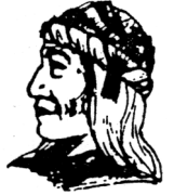
UGWA DEHOLUN YATEHE

Because of the help of this Oneida Chief in cementing a friendship between the six nations and the Colony of Pennsylvania, a new nation, the United States was made possible.