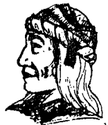
UGWA DEHOLUH YATEHE Because of the help of this Oneida Chief in cementing a friendship between the six nations and the Colony of Pennsylvania, a new nation, the United States was made possible.