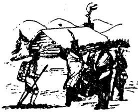
Onondas bringing several hundred bags of corn to Washington's starving army at Valley Forge, after the colonists had consistently refused to aid them.