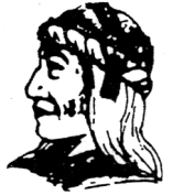
UGWA DEMOLUM YATEHE Because of the help of this Oneida Chief in cementing a friendship between the six nations and the Colony of Pennsylvania, a new nation - the United States, was