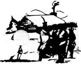
Oneidas bringing several hundred bags of corn to Washington's starving army at Valley Forge. after the colonists had consistently refused to aid them