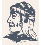
UGWA DEMOLUM YATEHE Because of the help of this Oneida Chief in cementing

six nations and the Colony of Pennsylvania, a new nation the United States, was made possible