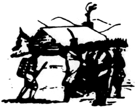
Oneidas bringing several hundred bags of corn to Washington's starving army at Valley Forge. after the colonists had consistently refused to aid them