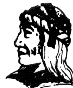
UGWA DEMOLUM YATEHE Because of the help of this Oneida Chief in cementing a friendship between the six nations and the Colony of Pennsylvania, a new nation, the United States, was made possible.